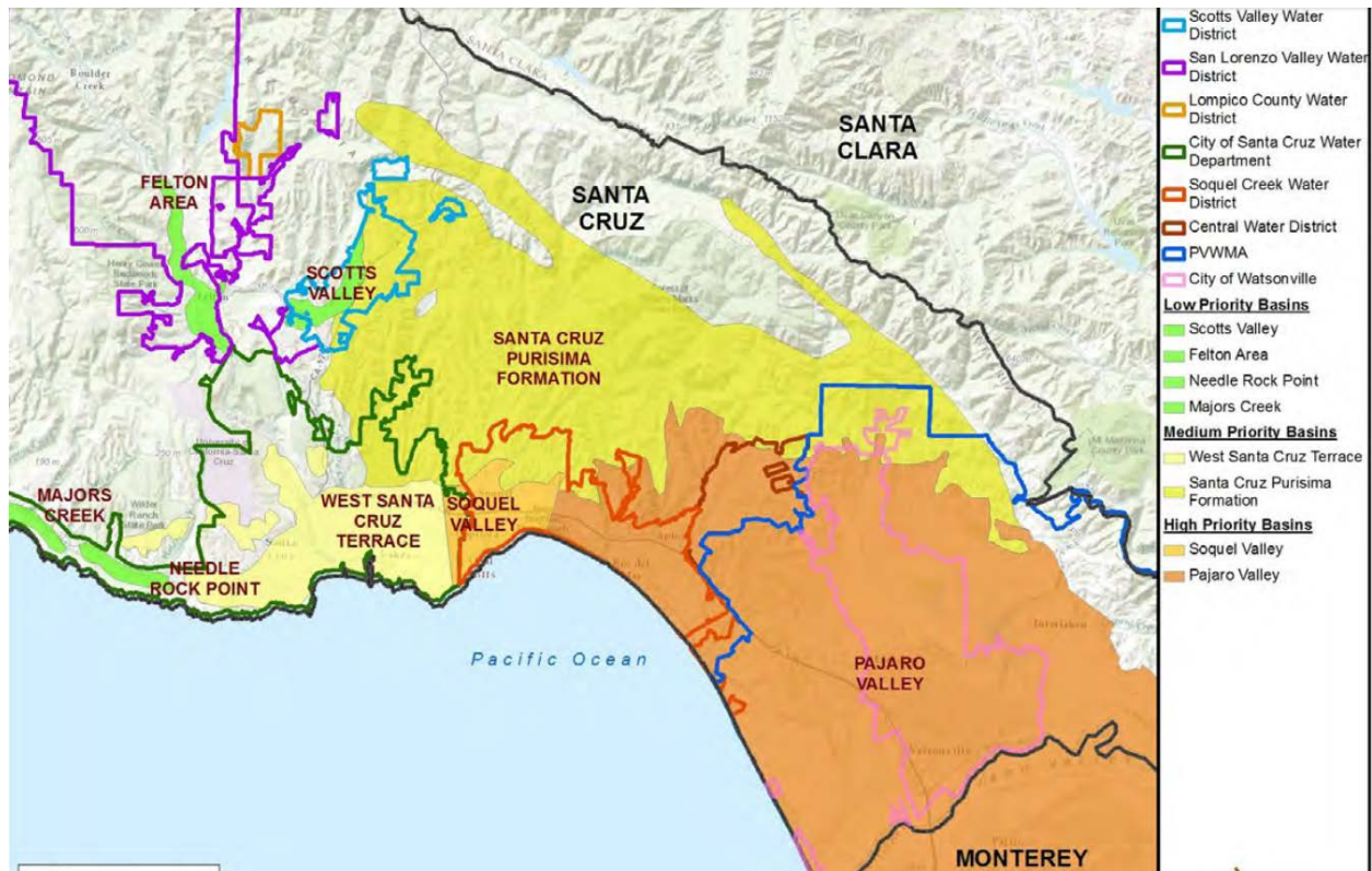
Agency Boundaries and State Bulletin 118 Groundwater Basins