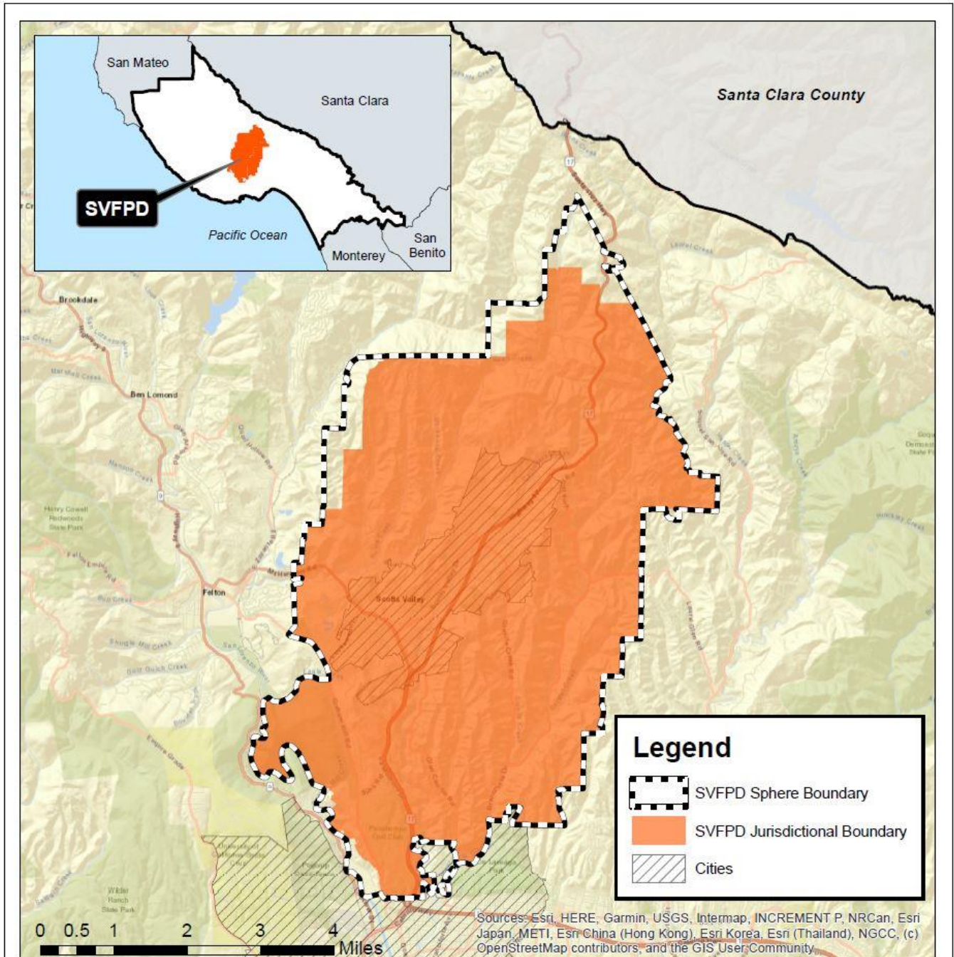
EXHIBIT B: VICINITY MAP (POST-REORGANIZATION)